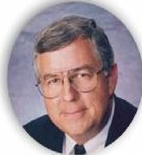
Sen. Enzi (R-WY)