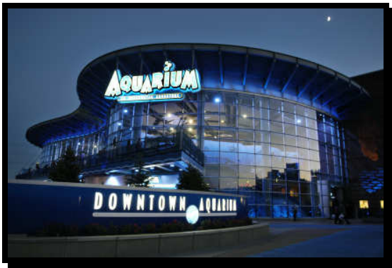
Exhibit hours 10-9pm Restaurant 11am-9pm

Sea Story- The Denver Downtown Aquarium was purchased by Landry's Restaurants, Inc. in 2003, when it was Denver's Ocean Journey Aquarium. On July 14, 2005, Landry's re-opened the re-designed complex as The Downtown Aquarium. The entertainment and dining complex features a public aquarium boasting more than one million gallons of underwater exhibits that highlight fascinating ecosystems around the world and house over 500 species of animals; an interactive Sting Ray Reef touch tank; the Aquarium Restaurant; the Dive Lounge; the Nautilus Ballroom; and amusements for everyone.